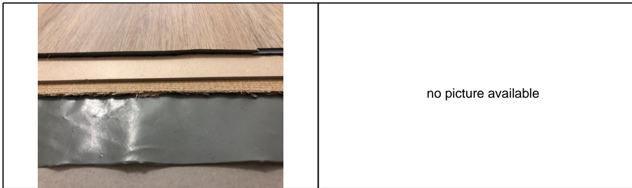
Illustration / drawing for sample assembly